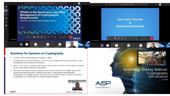
Cryptography, 1 Jul 2020

AiSP encourages former members to renew their membership status a few days before the event, so that they can enjoy their complimentary invites.