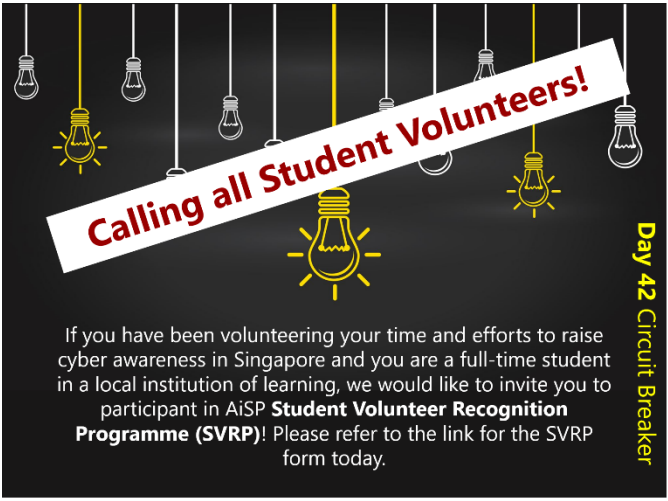
You're the Bright Spark in the Future of Cybersecurity Ecosystem!

We are inviting all student volunteers to submit their nomination form by 1 Sep 2020 , and also reaching out to groups of student volunteers and Student Chapters in Singapore to recognise student volunteers. Please email us if you want to be part of our movement!