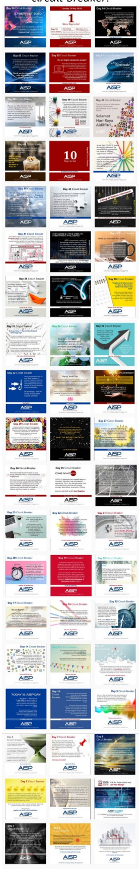
Our 56 days of digital efforts to cheer our members during circuit breaker!

Please contact secretariat@aisp.sg on membership, sponsorship, volunteerism or collaboration.