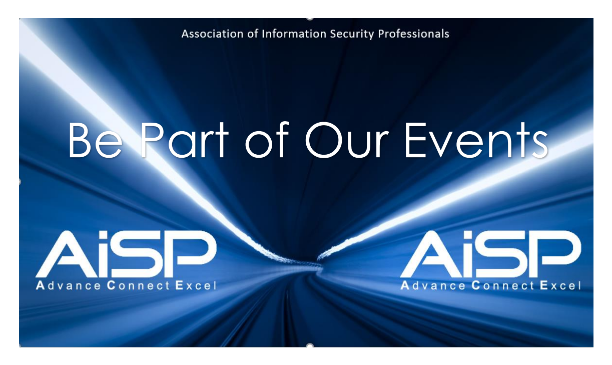
© 2008 – 2021 Association of Information Security Professionals. All rights reserved.

AiSP members who registered for the event, can playback the recorded event via their member profile in Glue Up. If you did not sign up for the event, please email <u>event@aisp.sg</u> for assistance. Please refer to our scheduled 2021 webinars in our <u>event calendar</u>.